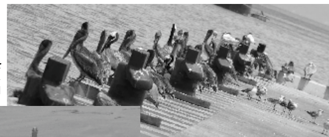
Below right Brown pelican, Panama Canal