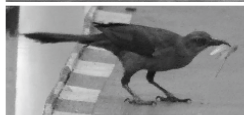
Above: Female Great-tailed Grackle on deck, feeding on grasshoppers (there were loads of the latter all over the ship that day), Quayaquil, Ecuador Right: Male Great-tailed Grackle, Cartegena, Colombia