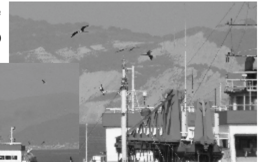
Above - Frigate birds Manta, Ecuador