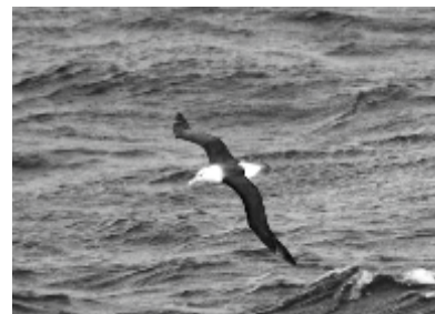
Albatross, Cape Horn

Sailing into the chillier waters of the South Atlantic, we picked up the odd albatross, the most iconic of which was the one that glided nonchalantly and effortlessly around us as we briefly dipped our proverbial toe into the Southern Ocean south of Cape Horn, to be scoured by the southern wind that roars incessantly round the globe at those latitudes, having no landmass in its path to break it up, before we scurried back to the safety of the glacial Chilean fjords for our journey north.