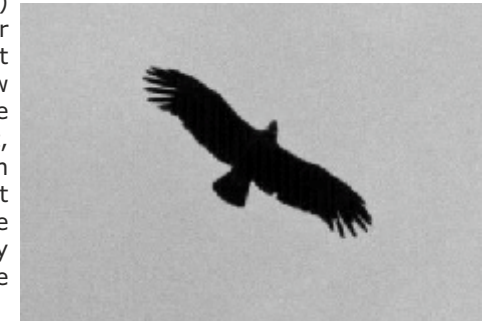
Below - Condor (allegedly), Peru

One of the biggest and happiest surprises of the entire trip was the Azores: beautiful, green rolling hills, lakes, hot springs - we will be going back to explore some day. In the meantime, here's a little chaffinch that was making busy not so very far from our group, completely unfazed by us.