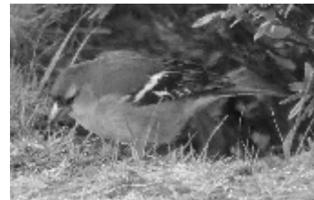
Left - Azorean Chaffinch (probably)

One of the biggest and happiest surprises of the entire trip was the Azores: beautiful, green rolling hills, lakes, hot springs - we will be going back to explore some day. In the meantime, here's a little chaffinch that was making busy not so very far from our group, completely unfazed by us.