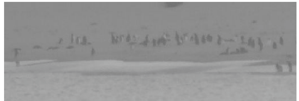
Below - Penguins on the shoreline, Falkland Islands