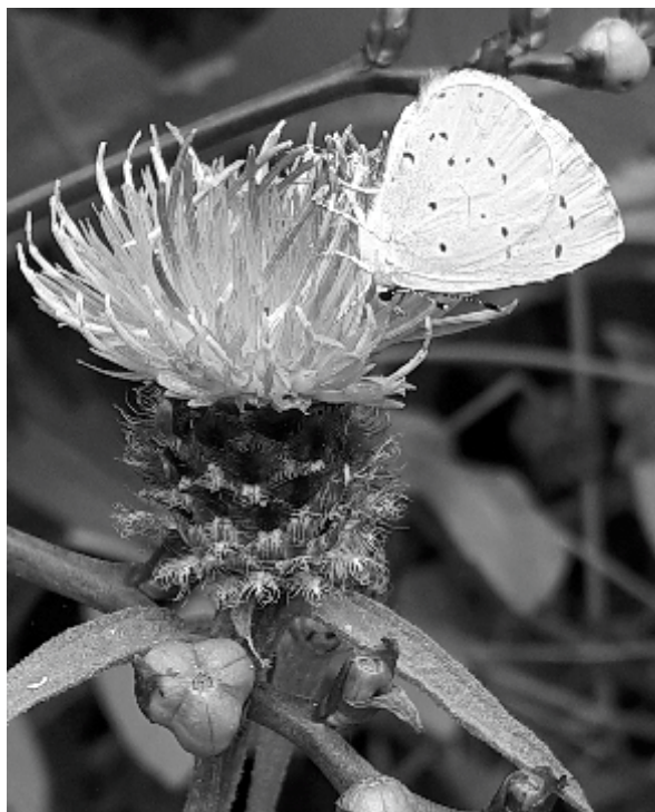
Holly Blue, count me in - Page 9

Help deliver me - page 2 Help with our Playing Field - page 3 Help the Owls, 2 hrs pw at Brownies - page 5 An epic journey - pages 12, 13, 15 & 17