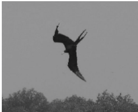
Frigate Bird, Guayaquil, Ecuador

I can't be sure where we picked up our first frigate bird - perhaps around the Ecuador, as we headed towards Brazil's north-east coast? What a marvellous sight! We were still quite a long way out at sea, and for much of the way round South America, there always seemed to be one soaring low over us, matching our speed without beating a wing, occasionally sweeping away to get some food. Huge spectacular looking birds, they put me in mind of pterodactyls whenever I looked skywards to see if our resident one (not the same one all the way round South America, I hasten to add!) was still there